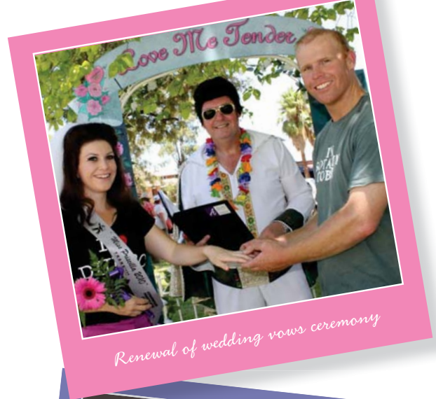
Renewal of wedding vows ceremony