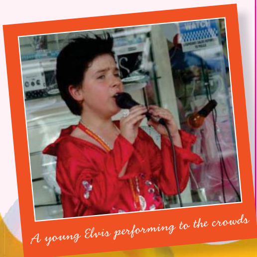
A young Elvis performing to the crowds