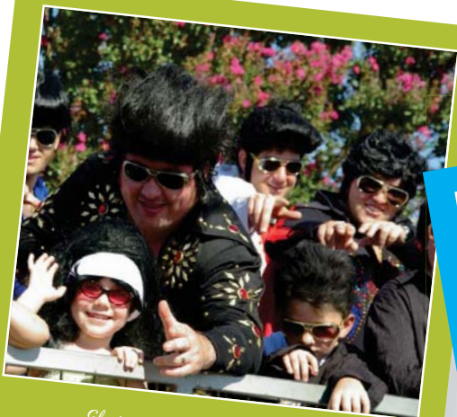
Elvis enjoying the parade