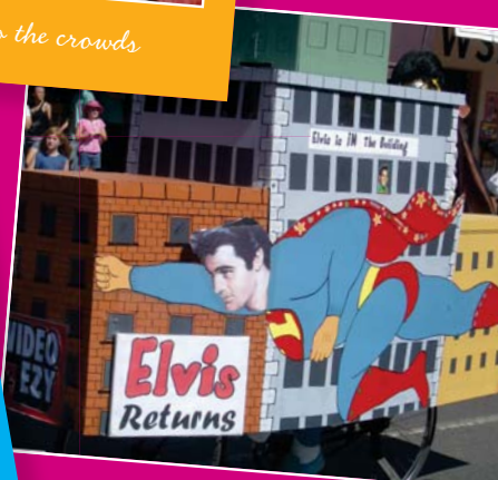
Elvis Returns Float