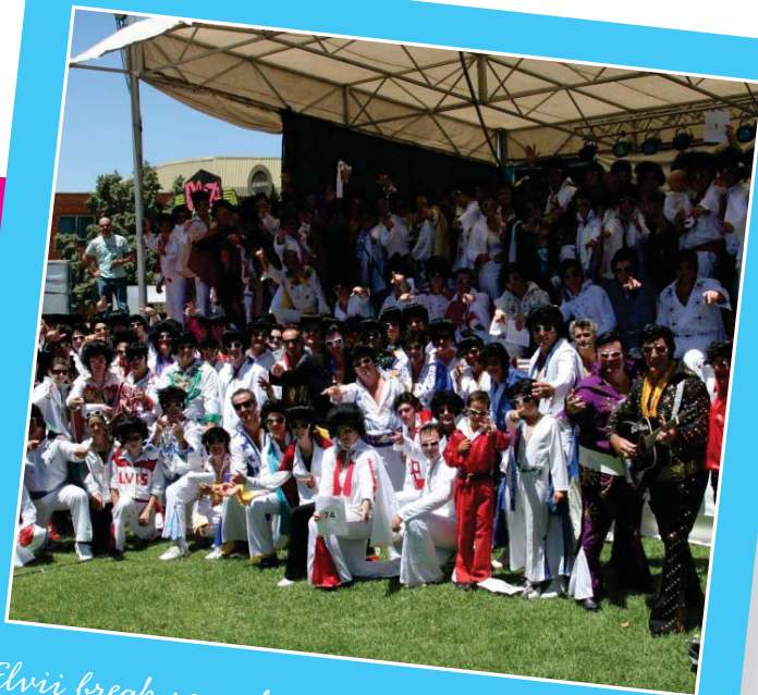
Elvii break record at Cooke Park Main Stage