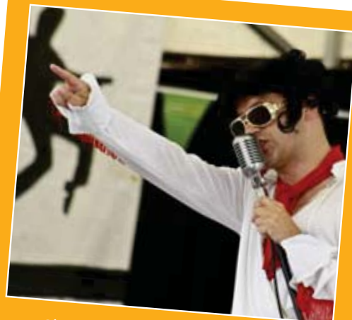
Elvis Idol Performs to the crowds